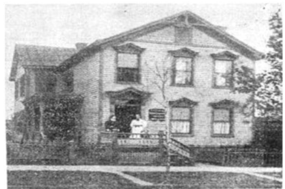
FIRST SETTLEMENT HOUSE —This former dwelling at 510 Third (formerly 98 Third Ave.) was the first headquarters of the Neighborhood Center, established 50 years ago as the Italian Settlement.