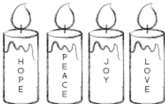
Advent Candle Countdown