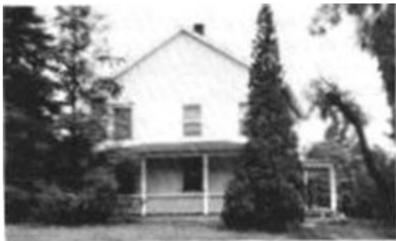
McKownville's First Church Building - Dedicated 1866 (Now a Private Residence)

Note the different (bolded) names below for Guilderland M.E. Church's mission post in McKownville.