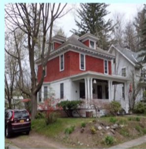
this was the parsonage of the McKownville Methodist Church 1919-1968