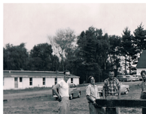
In back, chicken coop -> apts. -> SS

In 1954 a 23-acre plot of land bordering the church property was purchased. A