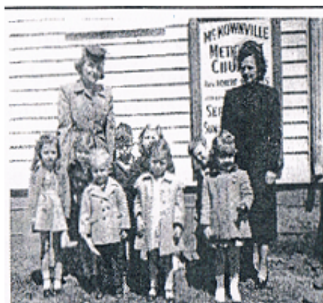
ca. 1947 Sunday School class (church did not become United M. C. until 1968)

In 1921 Sunday school continued in the summer except for a 4-week all-church vacation break . "The picnic of the Sunday School held at McKown's Grove last Saturday was well attended. .... There will be no services in the church the first four Sundays in August, the vacation period. Sunday School and services will again be held August 23th for the first."